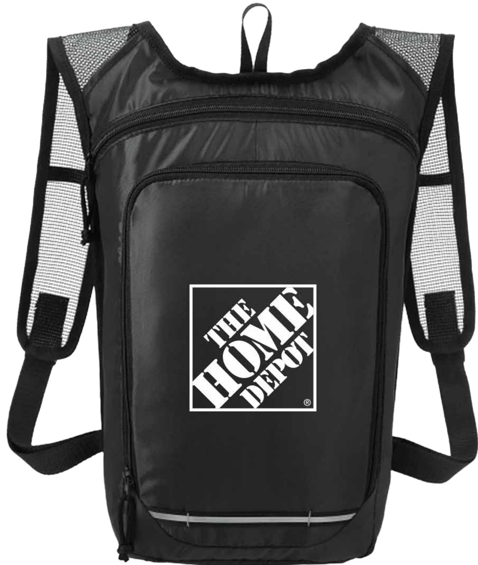
Trail Running Pack