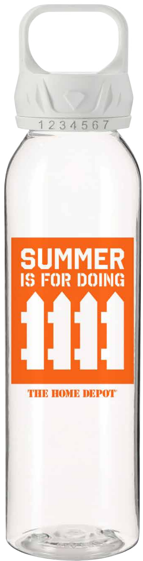
Smart Tritan Sports Bottle $5.10 Min. 100