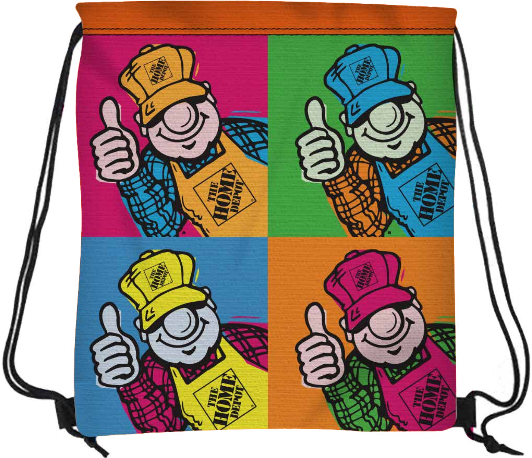
Canvas Drawstring Backpack