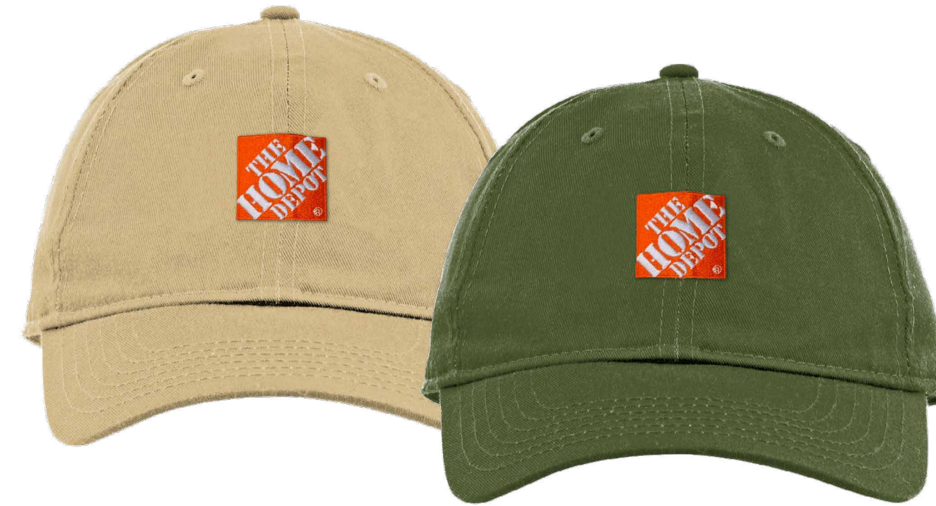
Recycled PET Cap