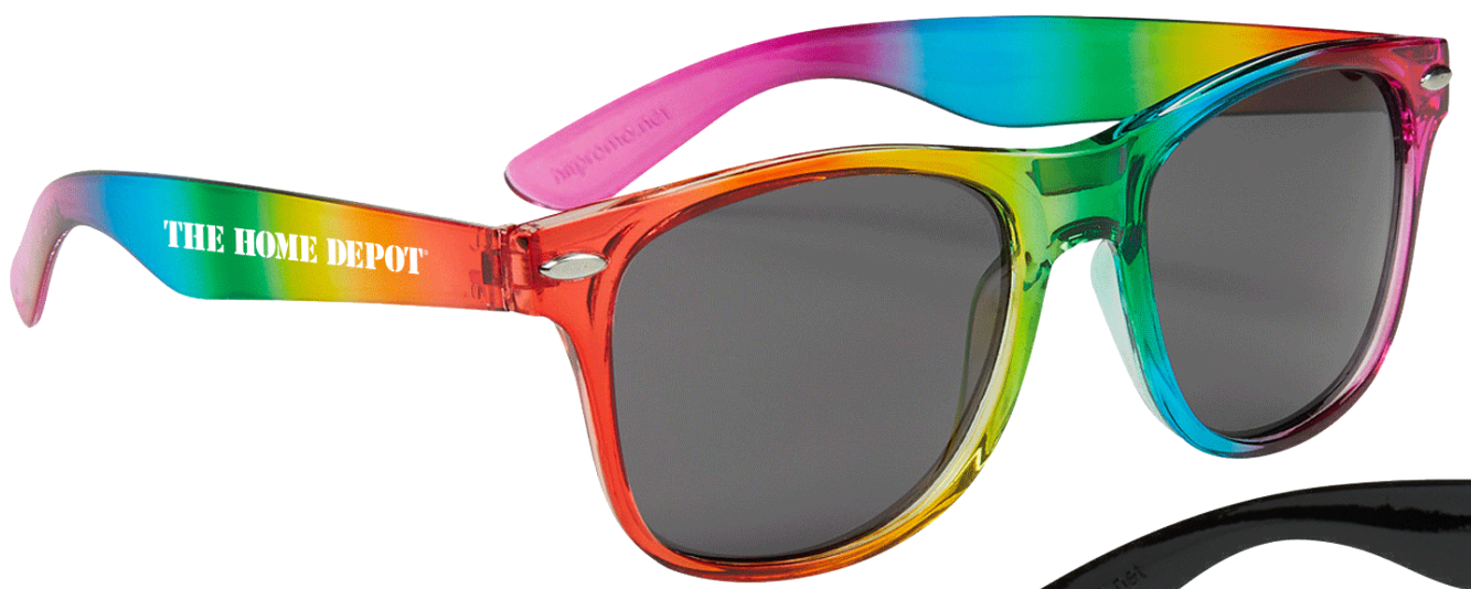
Sunglasses $2.50 Min. 100