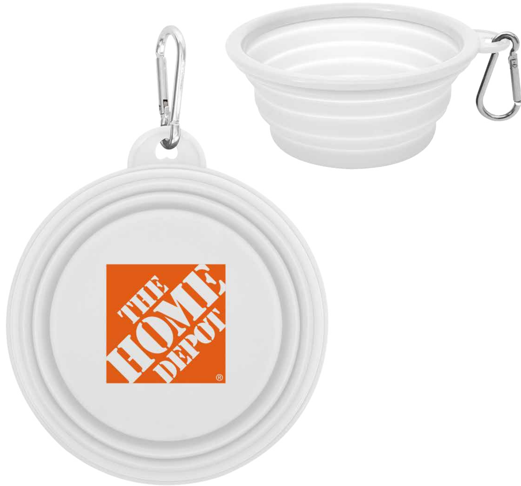
Collapsible Pet Bowl