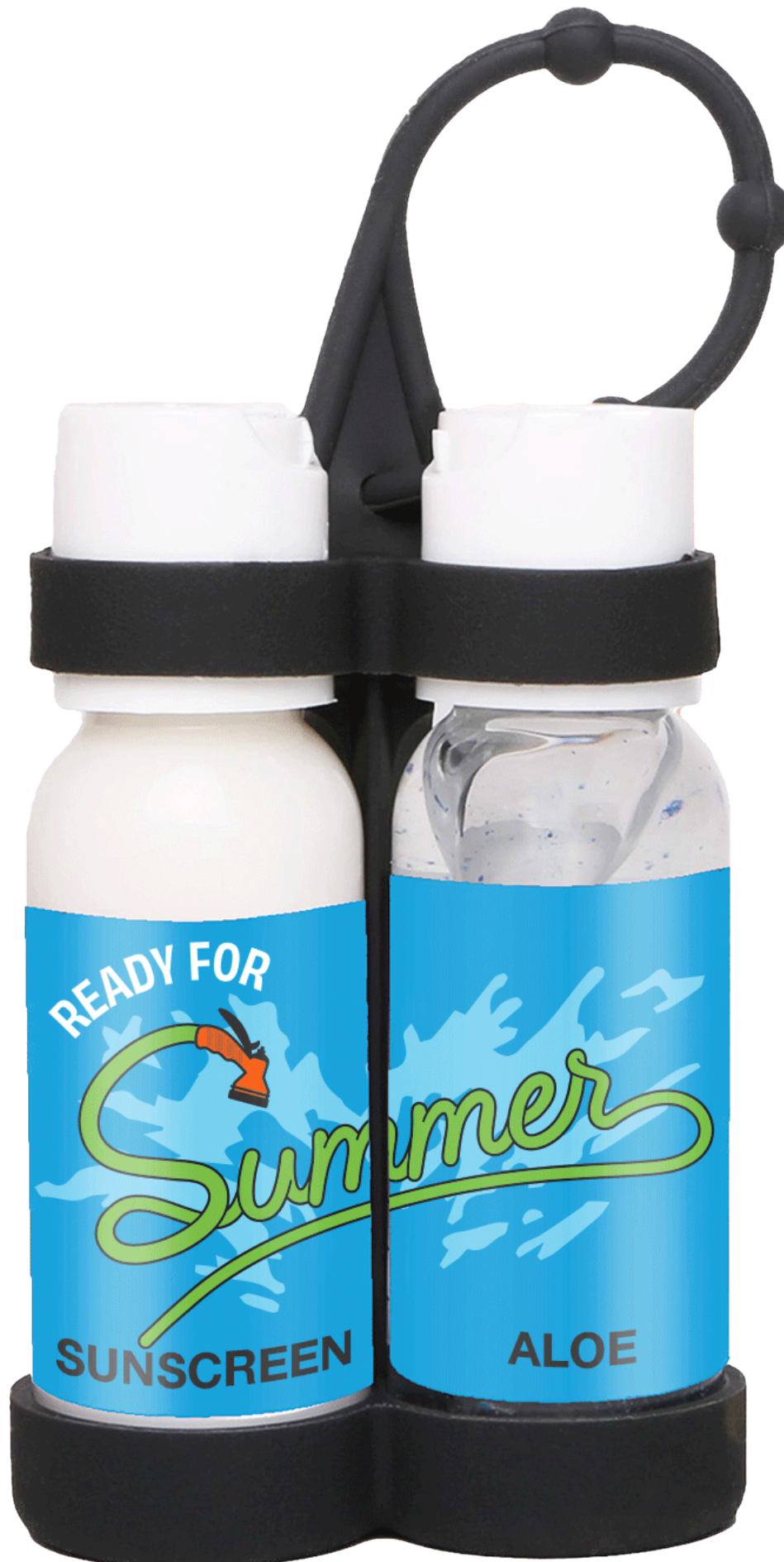
Sunscreen and Aloe Combo $4.00 Min. 100