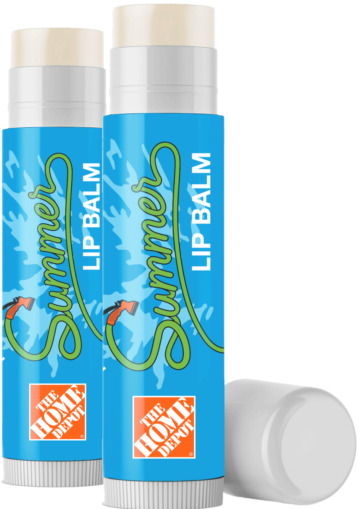
SPF 15 Lip Balm Mint or Tangerine Flavor $0.80 Min. 100