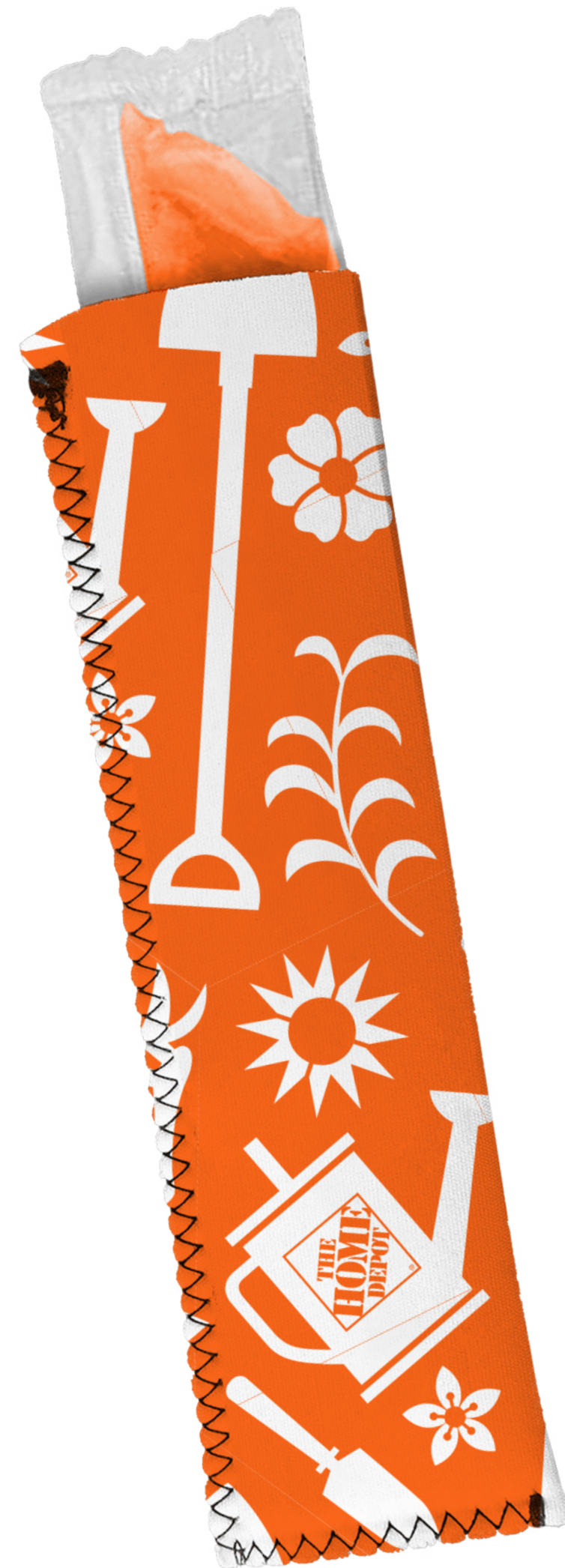
Ice Pop Coolie