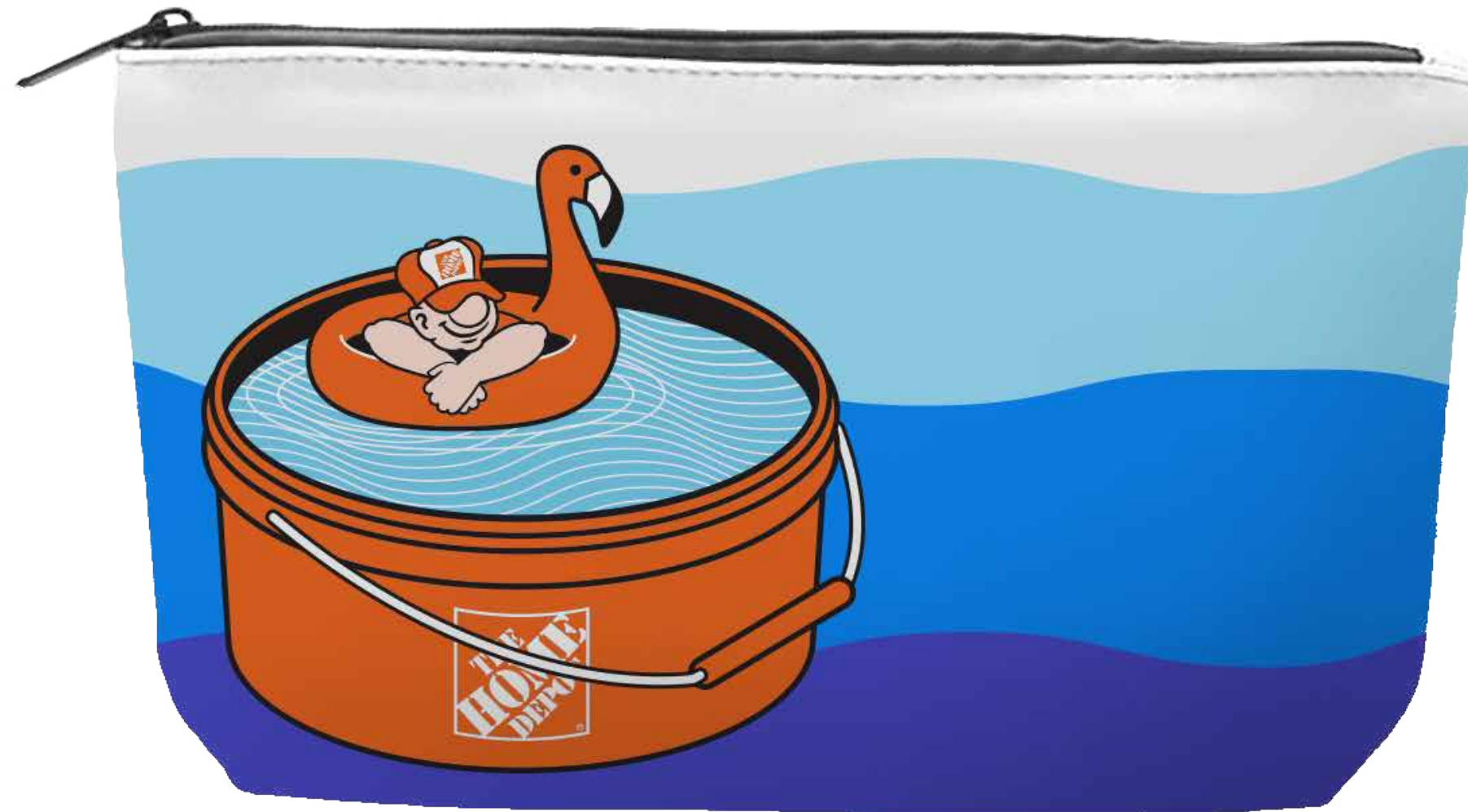
Tech Accessories Pouch 5" x 7.5"