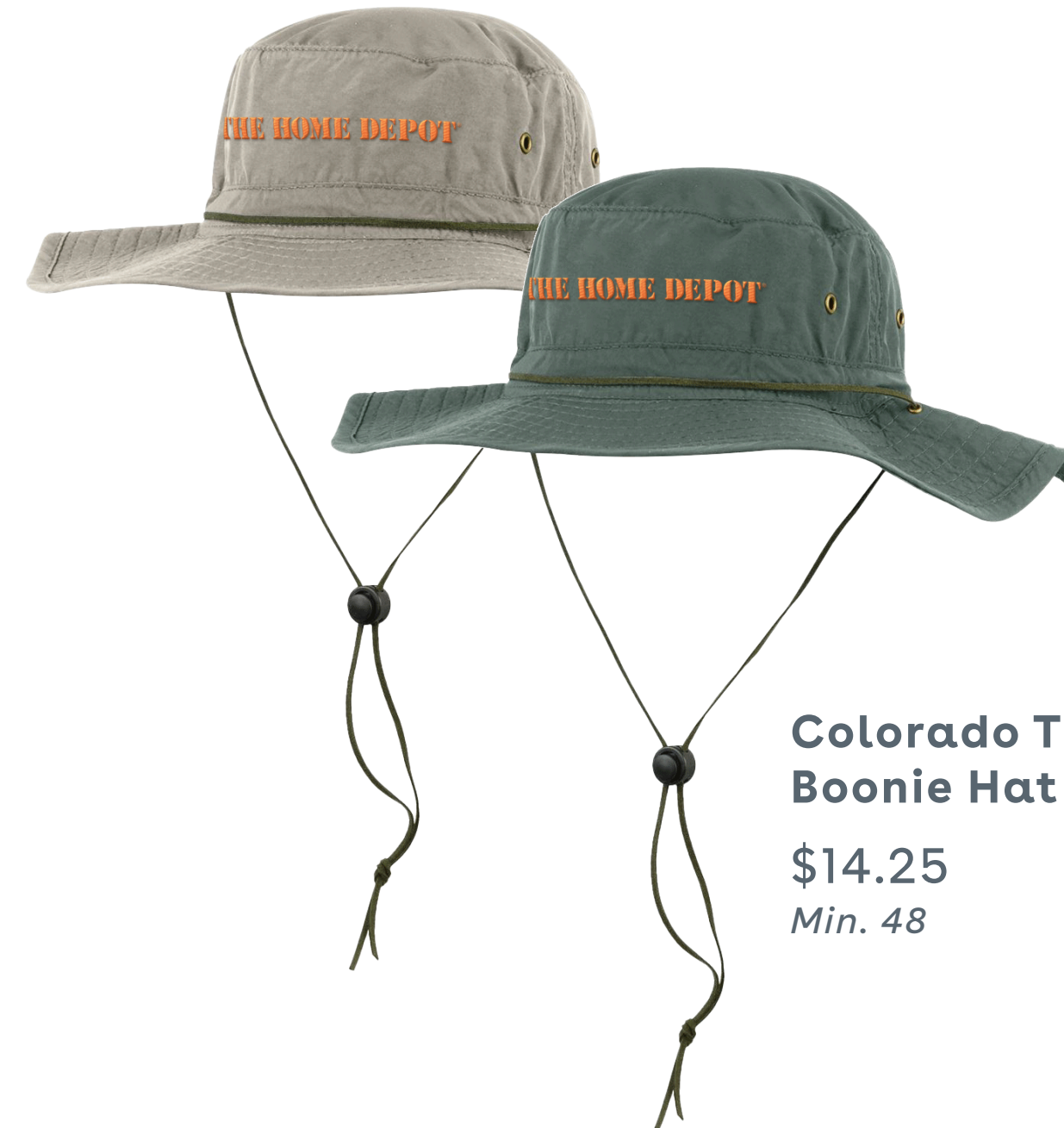
Colorado Trail Boonie Hat