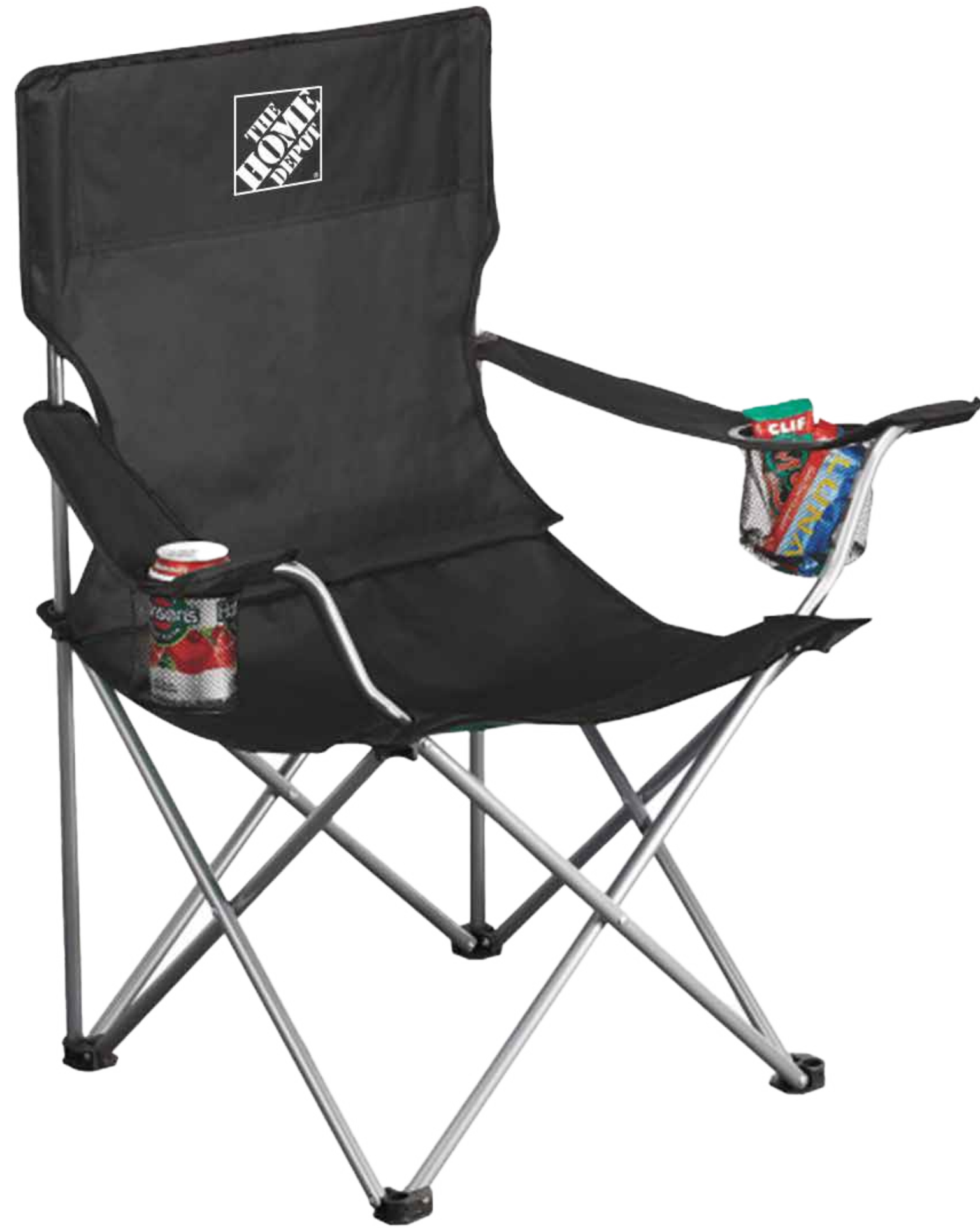
Event Chair w/ Carrying Case $24.00 Min. 24