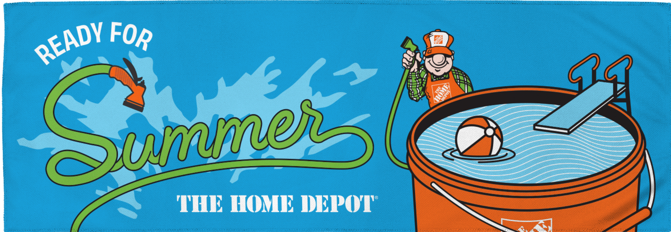
Cooling Towel 12" x 34.5" $4.80 Min. 100