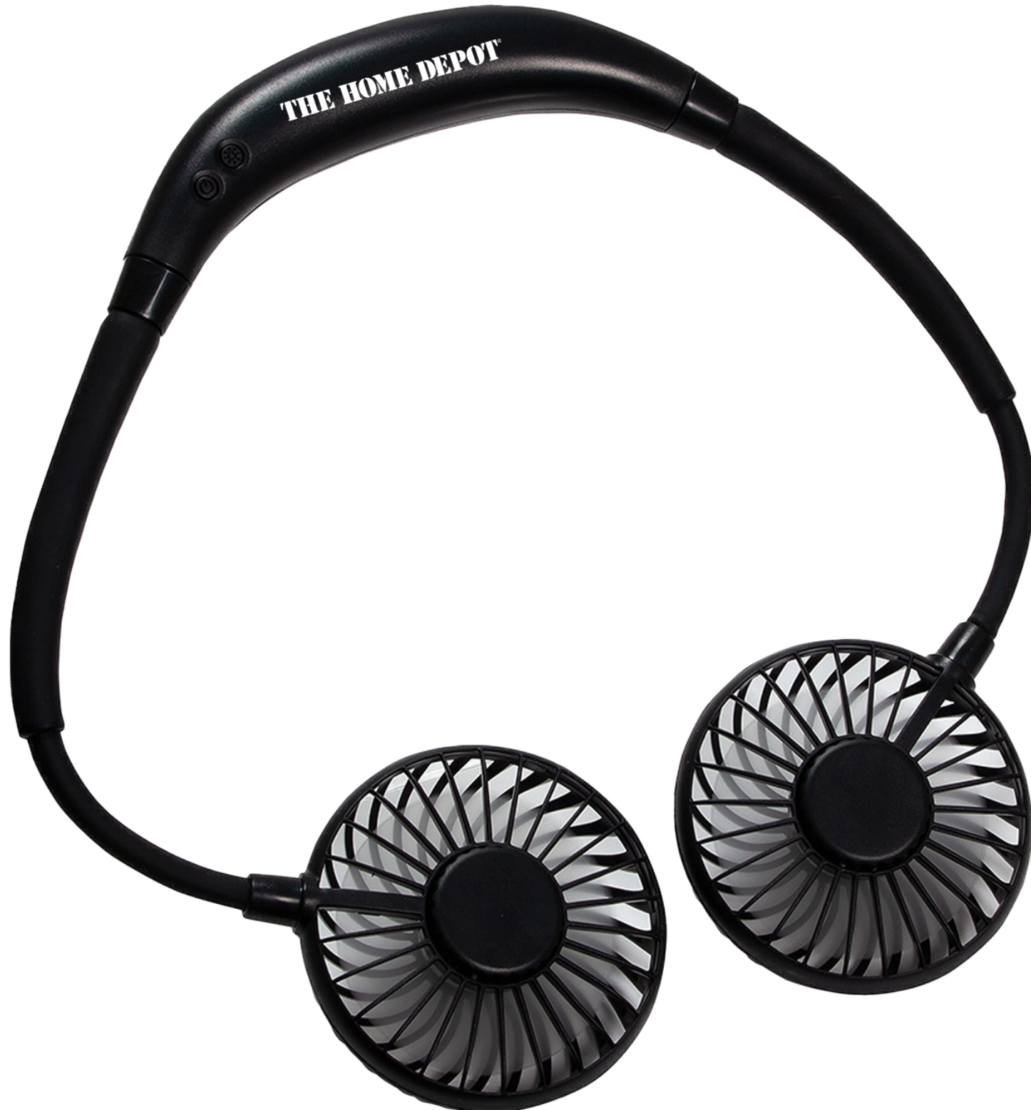
Hands Free Neck Fan $12.40 Min. 30