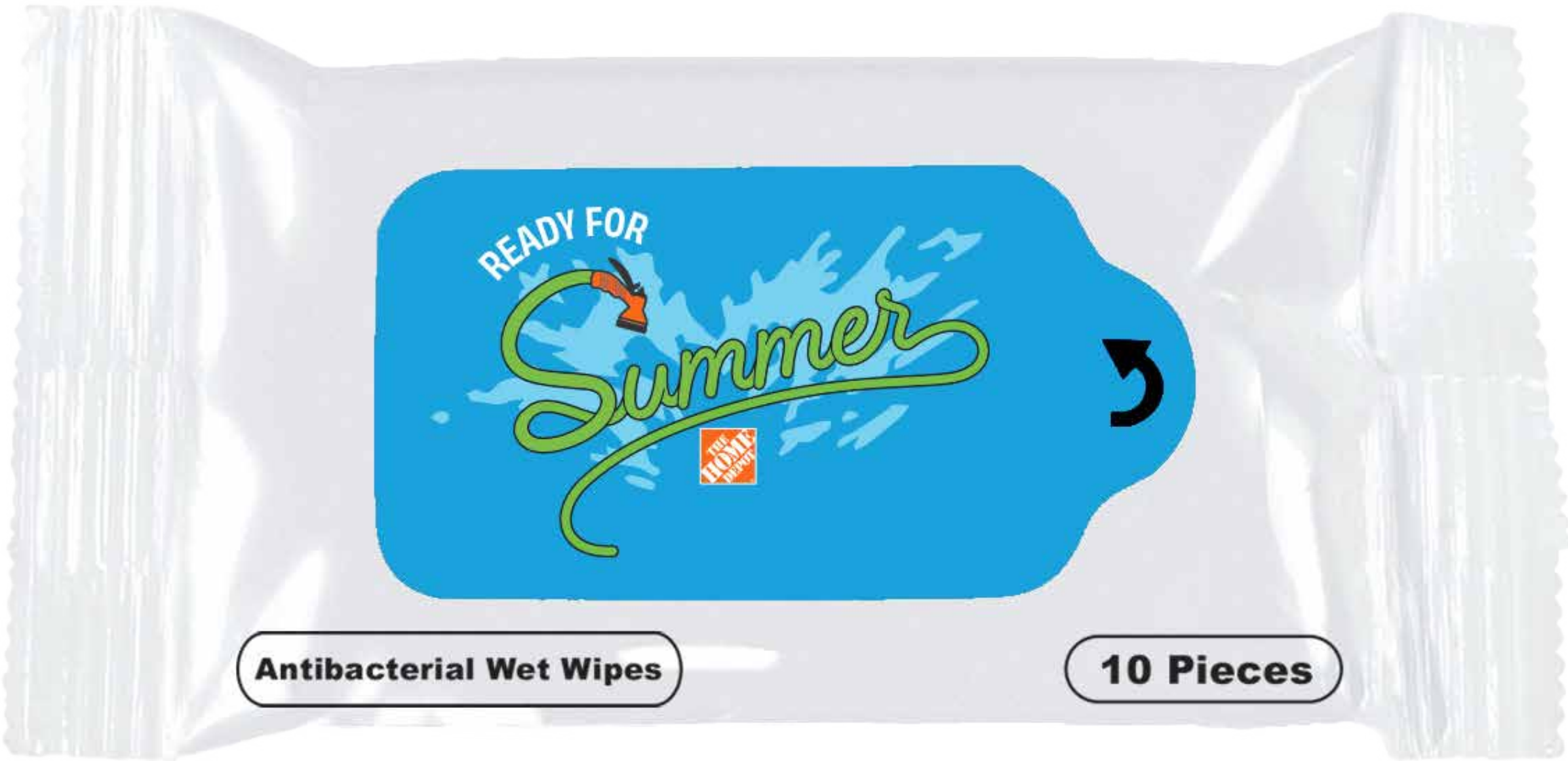
Pocket Antibacterial Wet Wipe Packet