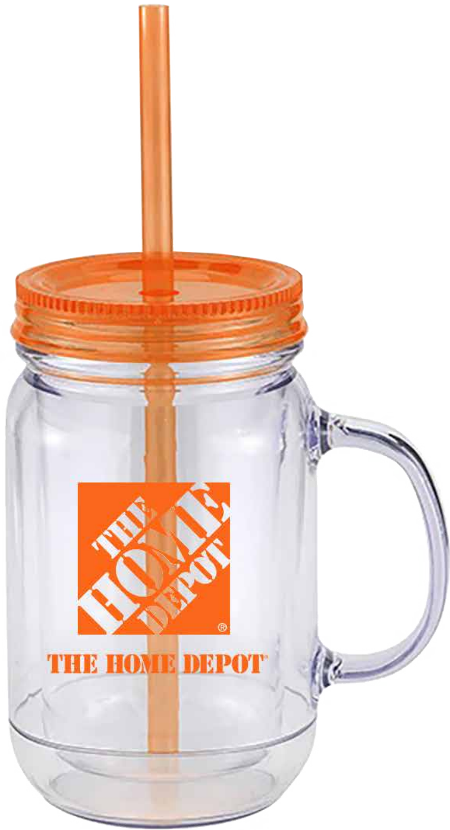
Double-Wall Plastic Mason Jar Tumbler $6.95 Min. 48