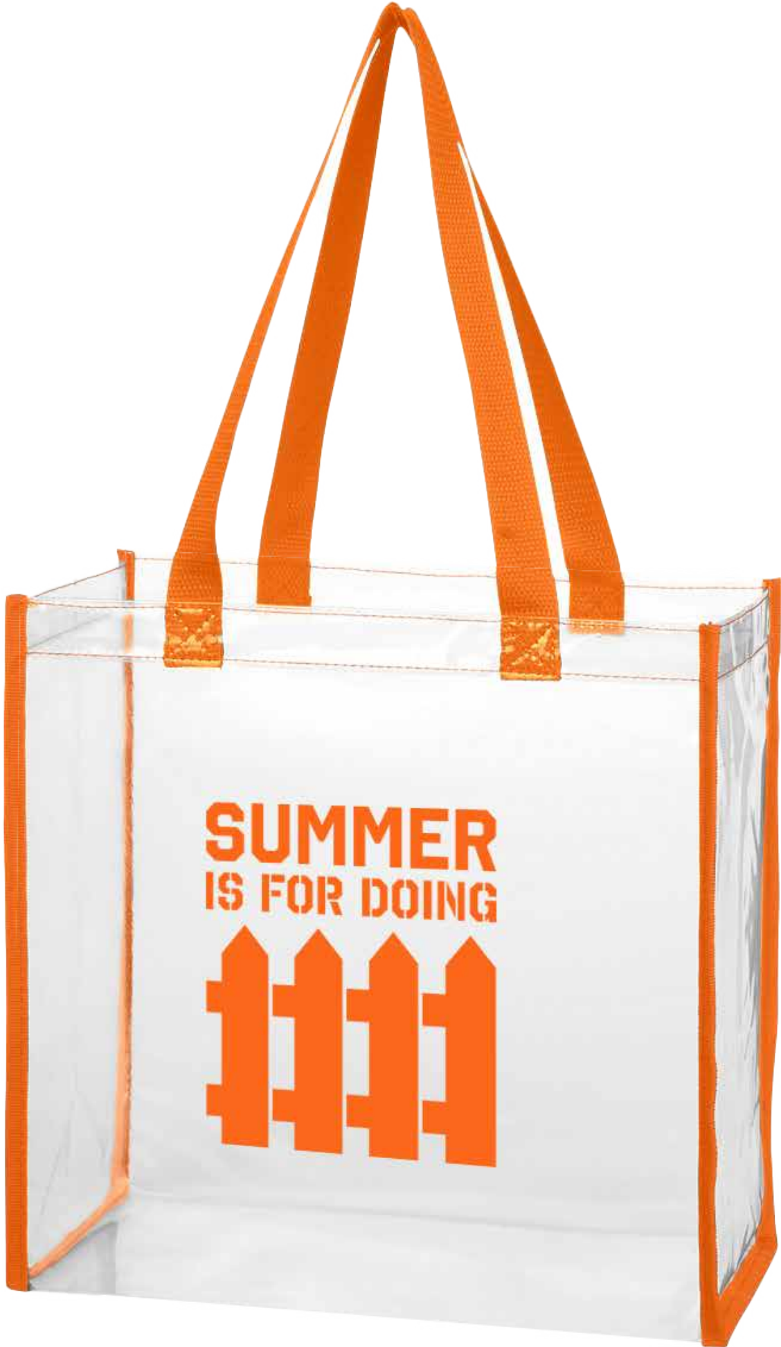
Clear Stadium Tote