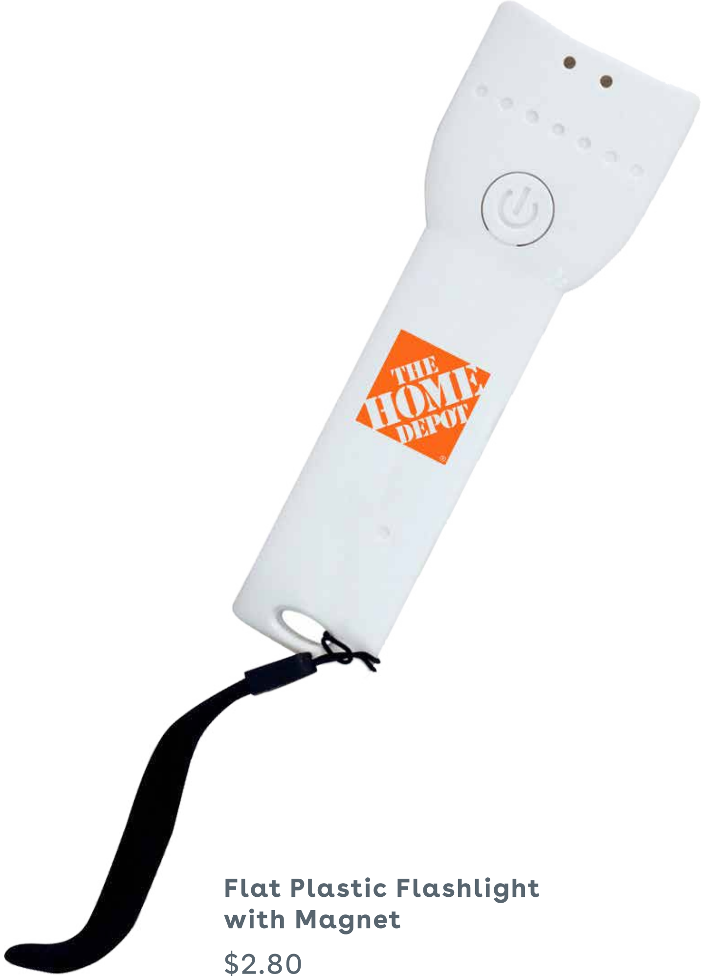
Flat Plastic Flashlight with Magnet