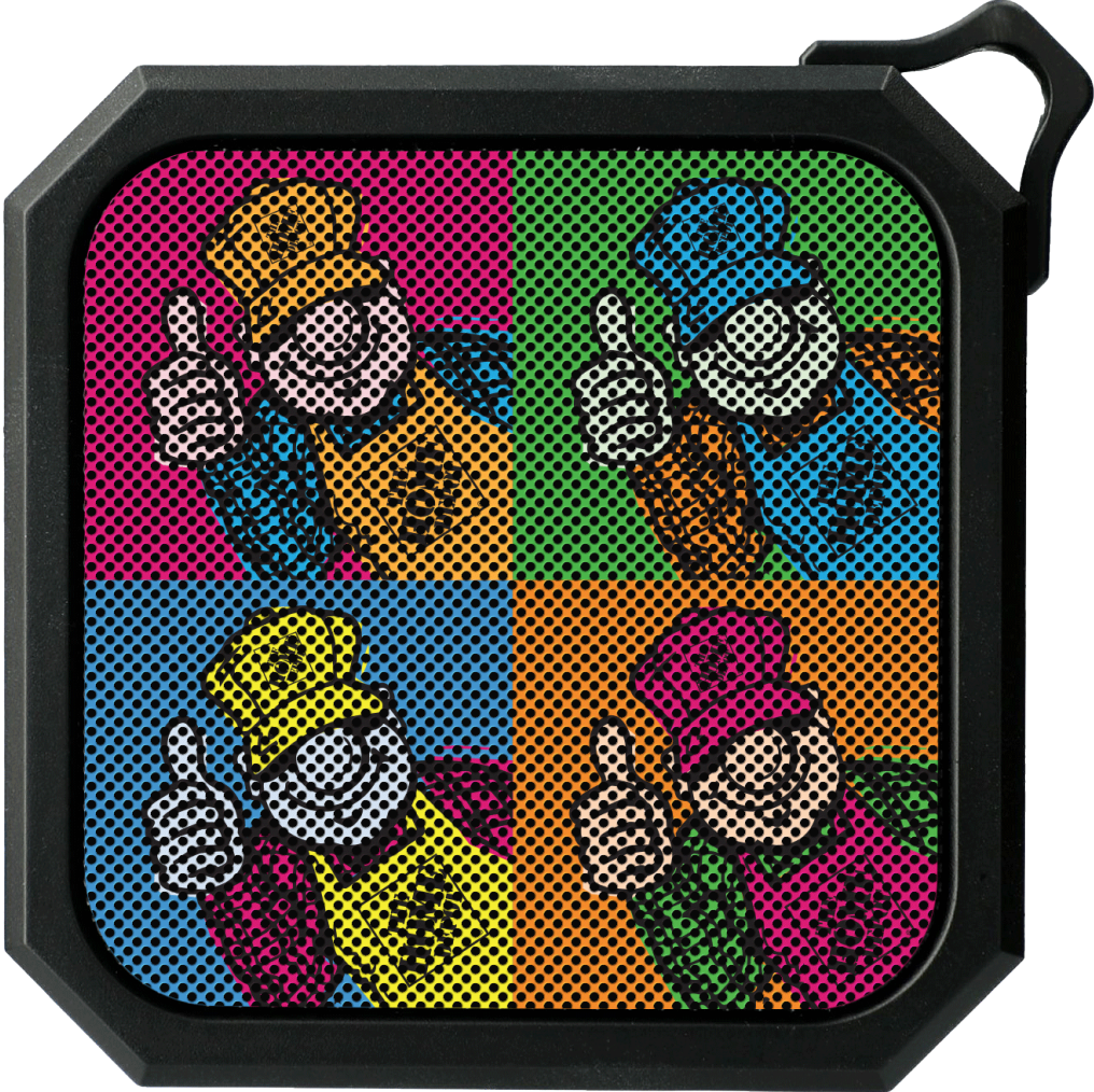
Waterproof Speaker $8.50 Min. 40