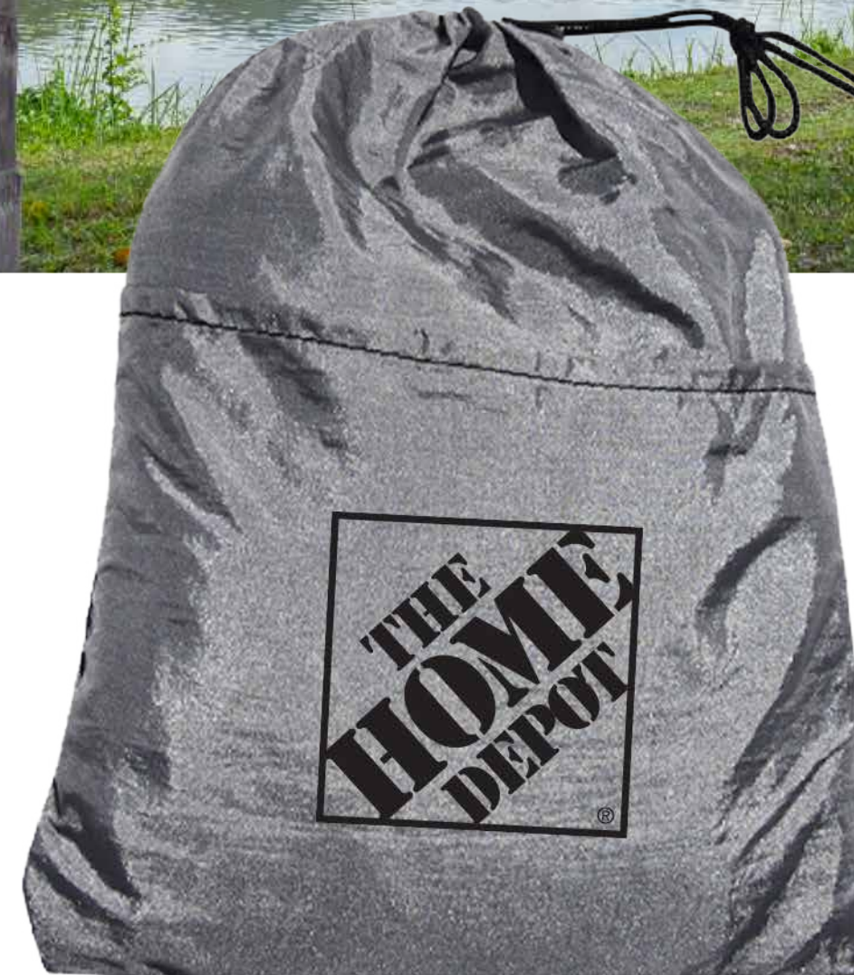
Packable Hammock $21.00 Min. 25