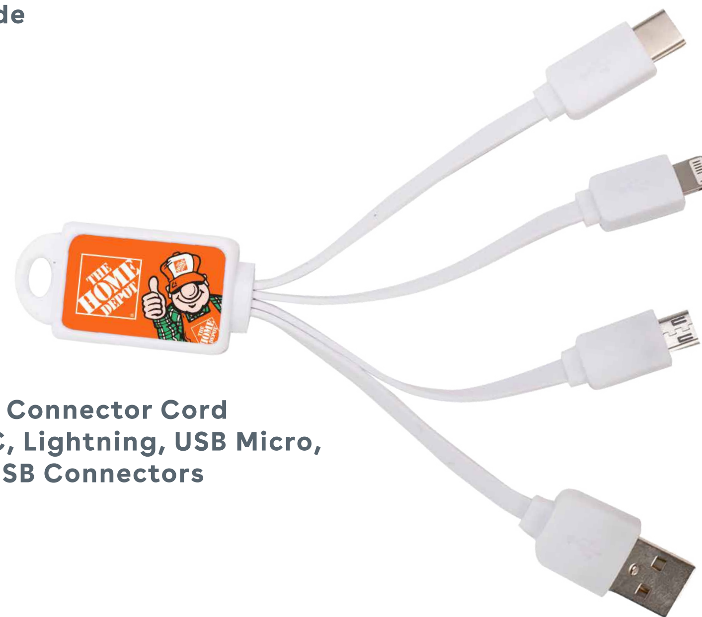
4-in-1 Connector Cord USB-C, Lightning, USB Micro, and USB Connectors