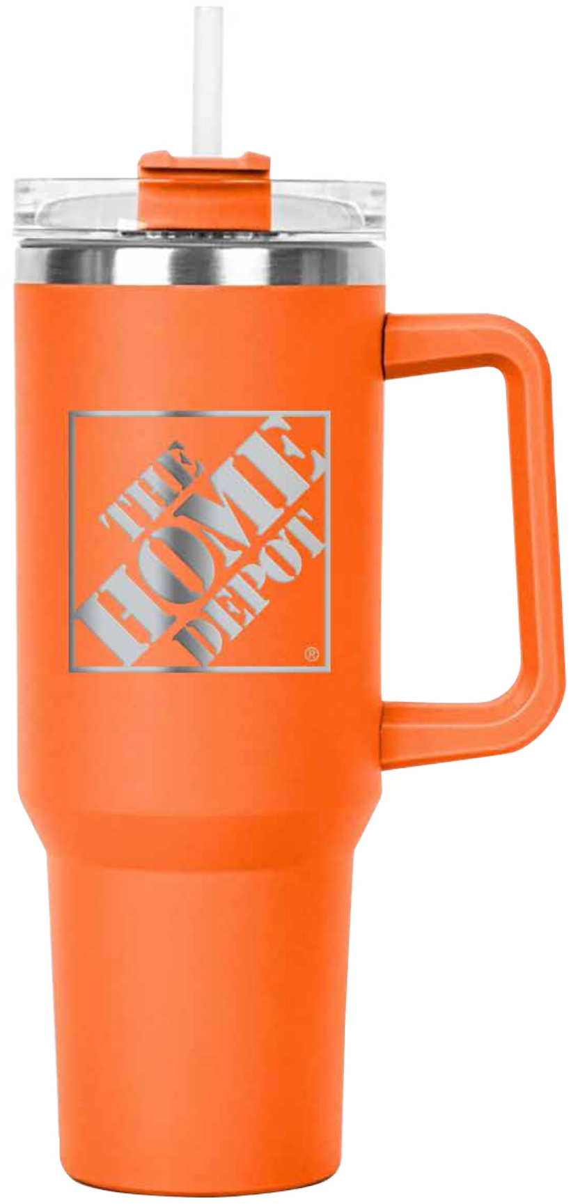
40 oz. Tumbler $17.50 Min. 50